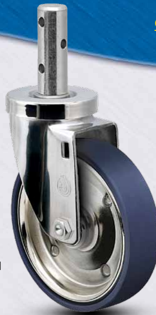
5-S32-113P (shown in photo)