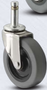
3-L3-201G (shown in photo)