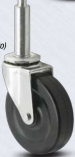
3-L5-101 (shown in photo)