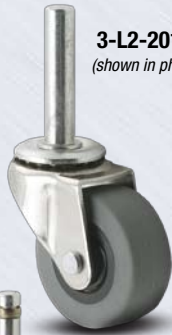
3-L2-201G (shown in photo)