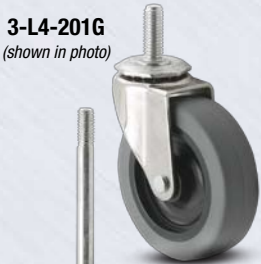
3-L4-201G (shown in photo)