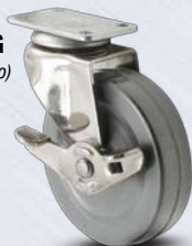
3-L9-201G (shown in photo)