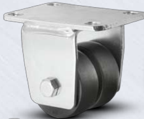
22-31-102-2 (shown in photo)

Top Plate Size: 2-3/8" x 3-5/8" • Bolt Hole Centers: 1-3/4" x 3" • Mounting Bolt Size: 5/16" diameter