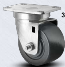
3-130-532 PLT 2 (shown in photo)

Stem Sizes: variety of stem sizes available – consult factory