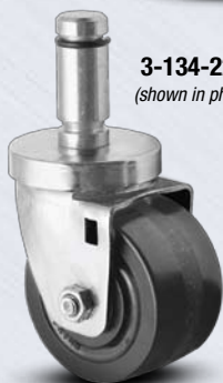
3-134-222 (shown in photo)