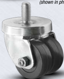
22-36-102 (shown in photo)

Stem Size: 7/16" diameter x 1-3/8" long. Brass spring ring is available (consult factory).