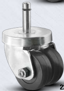
22-34-102 (shown in photo)

Top Plate Size: 2-3/8" x 3-5/8" • Bolt Hole Centers: 1-3/4" x 3" • Mounting Bolt Size: 5/16" diameter