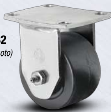
3-62-532 (shown in photo)

Top Plate Size: 3-1/8" x 4-1/8" • Bolt Hole Centers: 2-3/8" x 3-3/8" • Mounting Bolt Size: 3/8" diameter