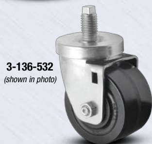
3-136-532 (shown in photo)