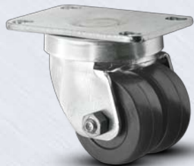
22-30-102-2 (shown in photo)