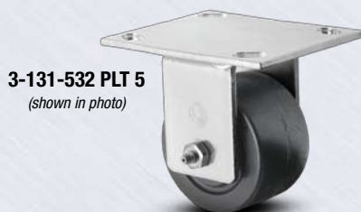
3-131-532 PLT 5 (shown in photo)