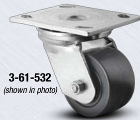
3-61-532 (shown in photo)