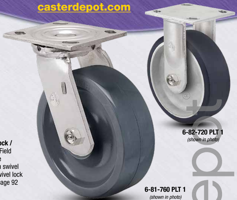
6-82-720 PLT 1 (shown in photo)