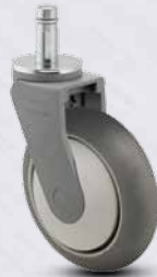
5-54HN-314GD STEM 1 (shown in photo)