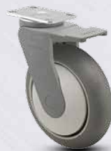
5-50HN-314GD TL PLT 2 (shown in photo)