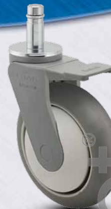
5-54HN-314GD TL STEM 1 (shown in photo)