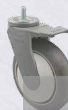
5-56HN-314GD TL STEM 1 (shown in photo)