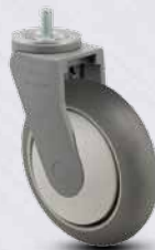
5-56HN-314GD STEM 1 (shown in photo)