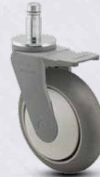
5-54HN-314GD TL STEM 1 (shown in photo)