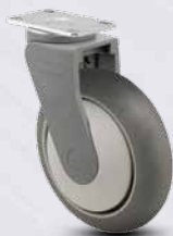
5-50HN-314GD PLT 2 (shown in photo)