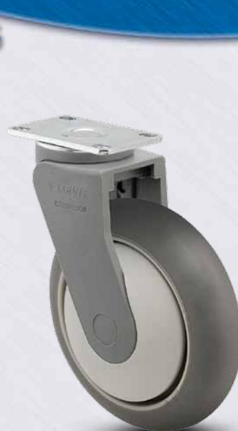
5-50HN-314GD TG A PLT2 (shown in photo)