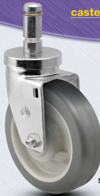
5-134-215G STEM 1 (shown in photo)