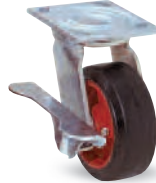
Side Foot Brake [not available on 8" dia. models]