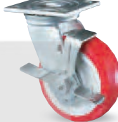
Tread Contact Brake

Swivel Construction – cold forged steel mounting plate and horn base. Legs ¼" plate steel, contoured to increase strength and welding area to the horn base.