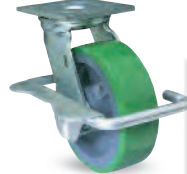
Rap-A-Round Foot Brake [not available on 3¼" dia. models]