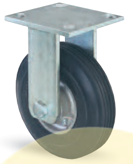
#R-8526-SU. Rigid Cush-N-Flex models are constructed of plate steel legs welded inside and outside to matching steel mounting plates.

Swivel Locks-4 position (★-4SL) -convert swivel to rigid for straight line steering. (only on #S-8526-SU, #S-8008-SU, #S-8528-SU, #S-8010-SU, and #S-8012-SU)