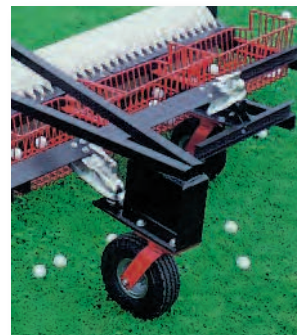
Golf ball collector rolls on pneumatic swivel casters.