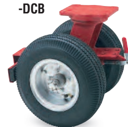
Dual Tread Contact Brake

Constructed of heavy duty steel components, this Dual Tread Contact Brake is also adjustable to compensate for tread wear and inflation pressure.