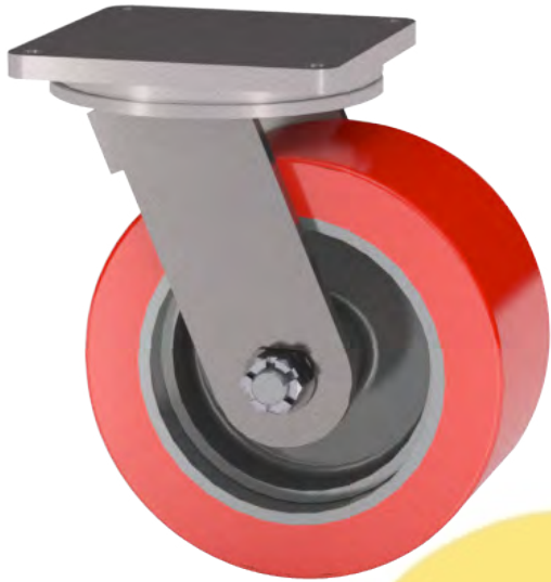
Item Shown: 99-18901-69-1