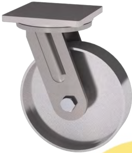
Item Shown: 95-12301-20-1