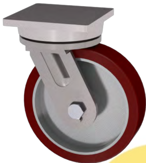
Item Shown: 91-12301-65-1