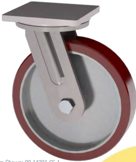
Item Shown: 90-14301-65-1