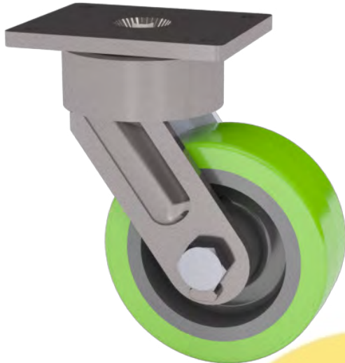
Item Shown: 87-08302-43-1