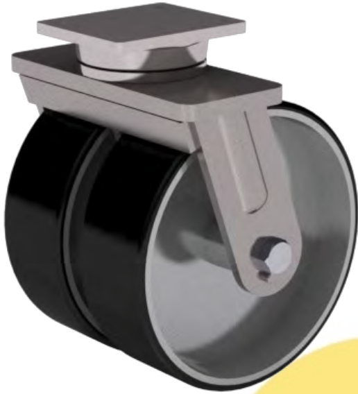
Item Shown: 2-81-14004501-60-1