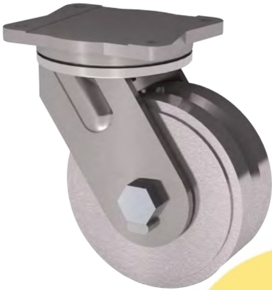
Item Shown: 80-08309-25-1