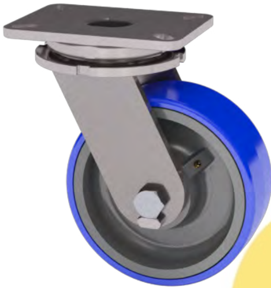
Item Shown: 70-08309-80-1