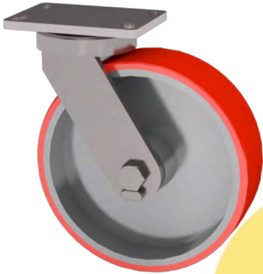
Item Shown: 61-10302-61-1