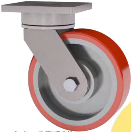
Item Shown: 55-6002002-91-12