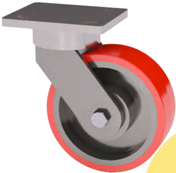
Item Shown: 51-6002002-61-12