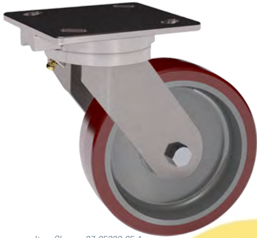
Item Shown: 37-05202-65-1