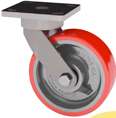
Item Shown: 27-06202-61-1