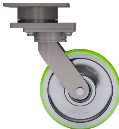
(ITEM SHOWN: SP13062321)