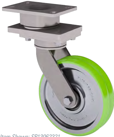
Item Shown: SP13062321