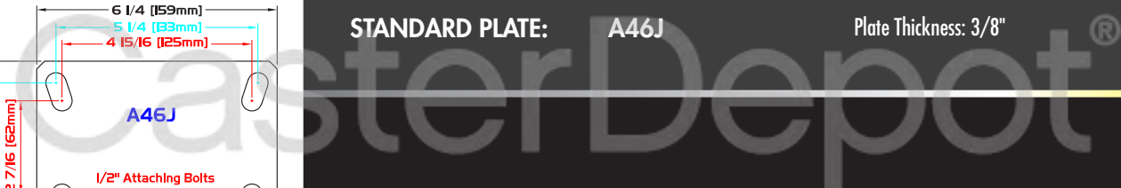
Plate Thickness: 3/8"